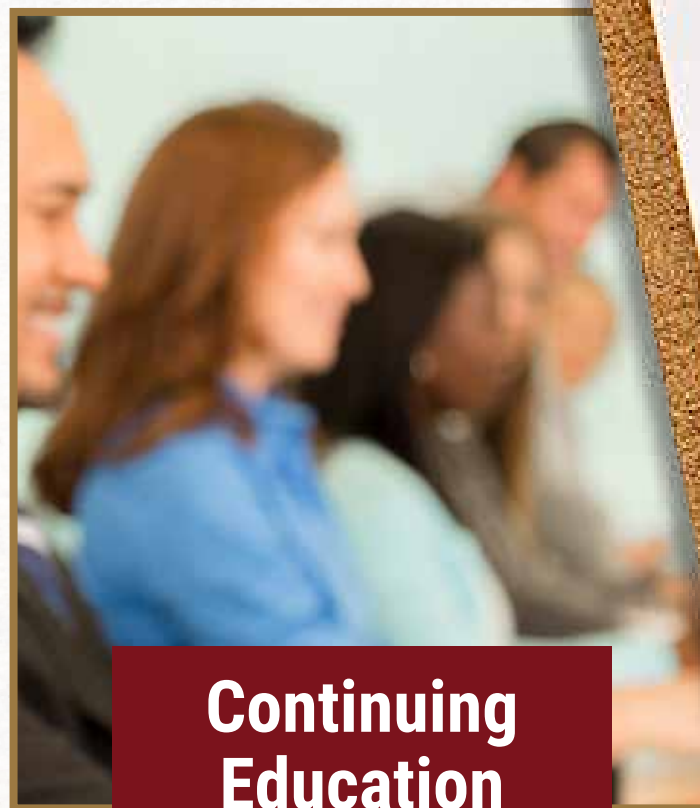
Continuing Education Courses