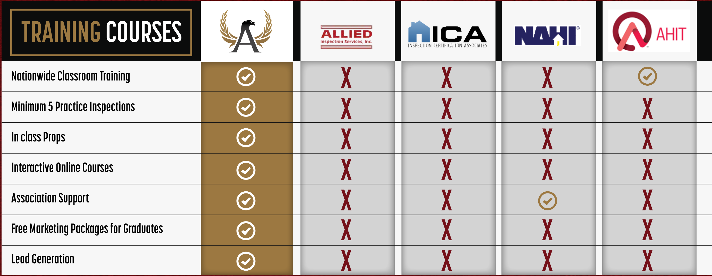
The ATI Training Program vs the “online certificate” option